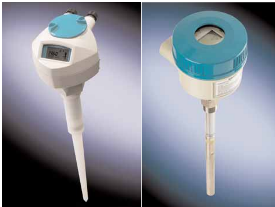
Siemens SITRANS LR 200 (left) radar level and Pointek CLS 300 capacitance point level are among the many recently introduced PROFIBUS devices from Siemens, a major industrial automation and instrument supplier.

of the control system. At the end of the day, does it matter whether the control loop is processed in the field or centrally as long as you have a reliable communication layer and effective device monitoring and control? You could make philosophical arguments either way but, for most applications, the answer to this is “No.”